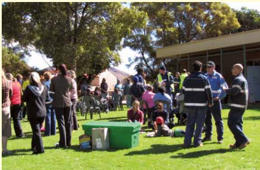
Scene from the opening day of NAIDOC Week 2010 in Tom Price.