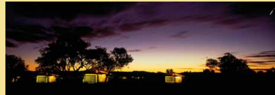
Shooting star at Karijini

off will be the creation of job opportunities for the Traditional Owners in their traditional lands.”