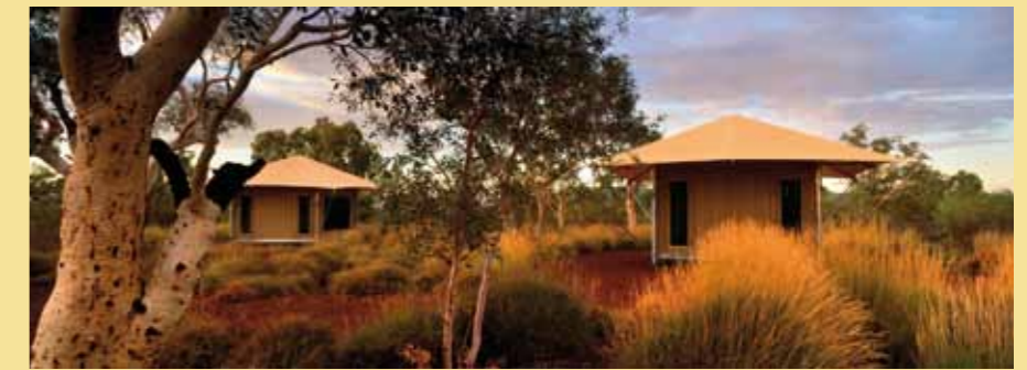
Karijini Eco Retreat