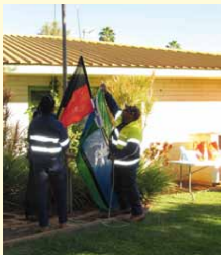
The flag raising ceremony