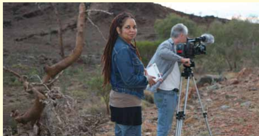
The film 'My Nan and the Yandi' is available for viewing on Gumala's newly revamped website ( www.gumala.com.au )

"When I was growing up in Marble Bar, all the parents worked and my Nan looked after all the grandchildren. She taught me how to read and write, and she told me many stories. I particularly want people to know of and be proud of the Pilbara strike that the film talks of, which was the first Aboriginal strike ever."