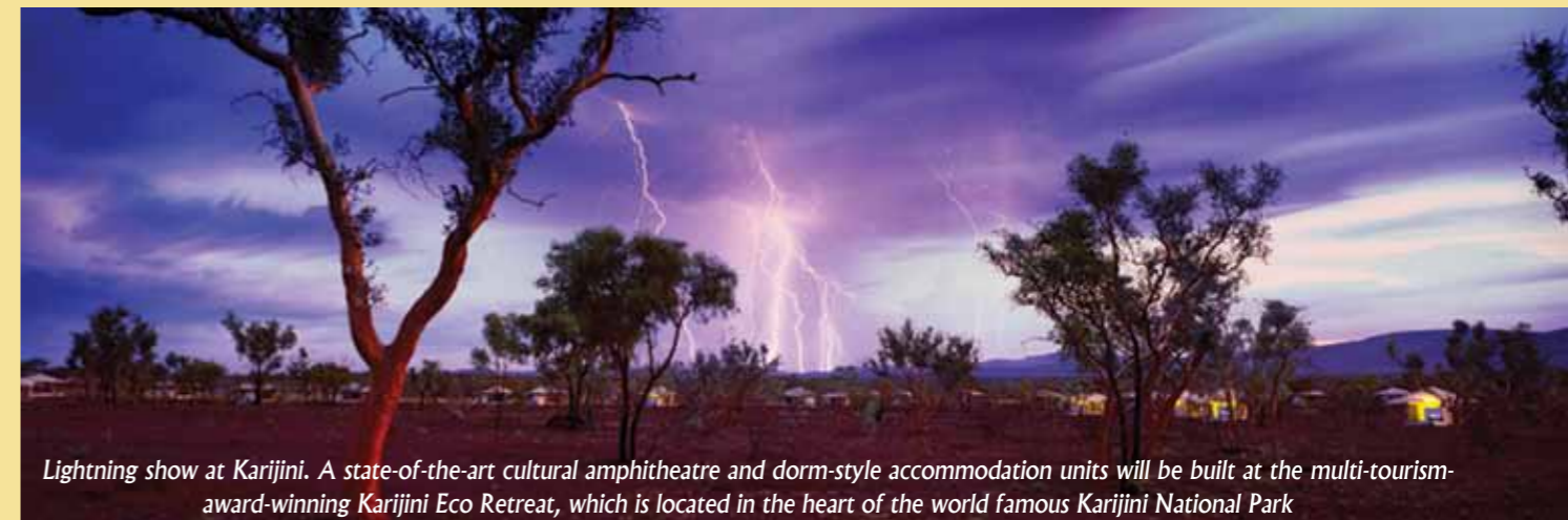
Lightning show at Karijini. A state-of-the-art cultural amphitheatre and dorm-style accommodation units will be built at the multi-tourism-award-winning Karijini Eco Retreat, which is located in the heart of the world famous Karijini National Park