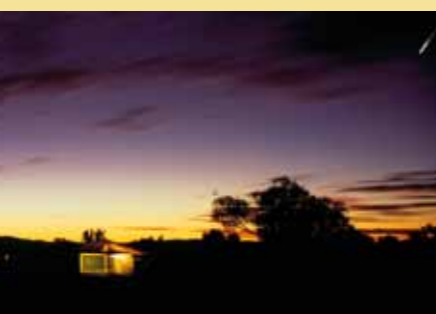
Shooting star at Karijini

“During school holidays, this new accommodation option also offers us the exciting opportunity of catering to the exponentially expanding