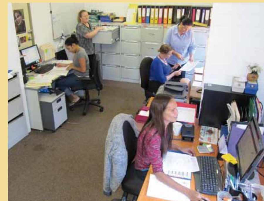
A recent photo of GAC's always busy Members' Services Unit (MSU)

• We kindly remind Members that when calling us please tell the Receptionist what your enquiry is regarding so they may forward the call to the right staff member.