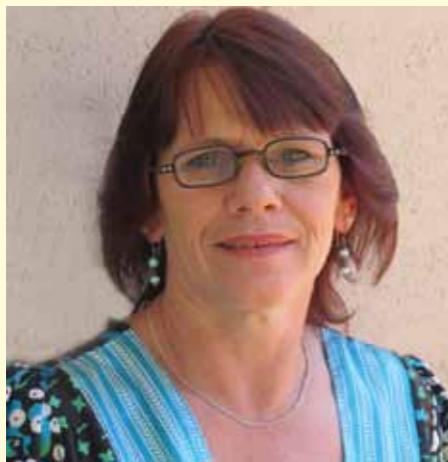
– Gumala Aboriginal Corporation's Members' Services Manager

"Providing quality of service to our Members is our number one goal. It's what we come to work for every day."