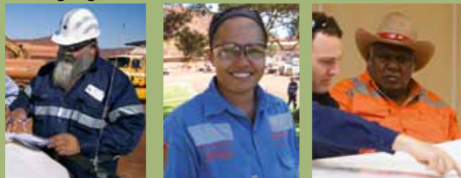
with local communities

Just as our name suggests, Gumala (which means all together) is working together with local communities. Headquartered in Tom Price, we are a member-based organisation that provides services to help improve the standard of living and quality of life of the Members we serve.