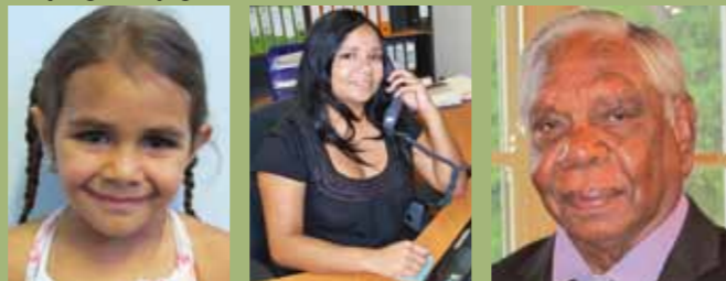
move forward together