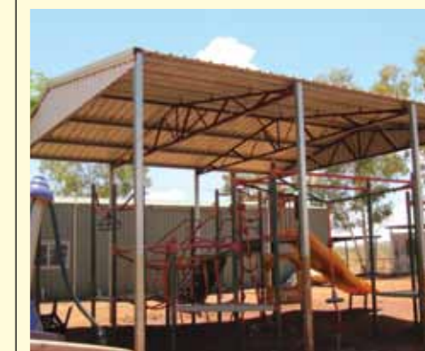
The basketball courts at Youngaleena will be upgraded by Gumala. We also plan to carry out upgrades at all our communities' playgrounds