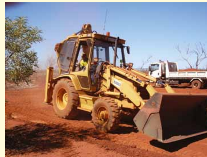
Gumala's Lore Camp upgrade program, which involved Gumala Members assisting in the majority of the works, consisted of infrastructure upgrades including the laying and installation of water pipes, fencing and ablation blocks installation.