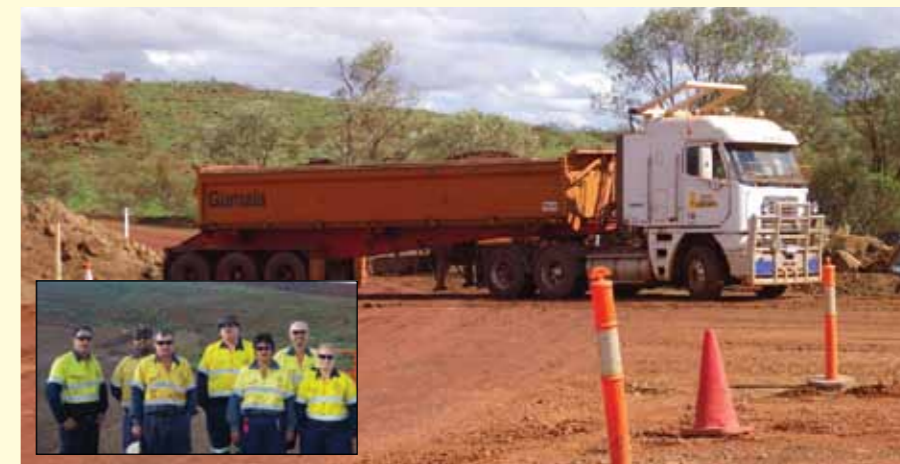
Gumala Contracting continues to expand its operations and workforce, as well as securing new contracts in the mining sector in the Pilbara. Inset: one of the teams of Gumala Contracting workers involved in Rio Tinto Iron Ore projects.

The company is also currently carrying out an Explosives Compound Security Upgrade Project at the Paraburdoo Mine Site. Gumala Contracting is the main contractor for this $4.7 million project, which commenced in mid-January and is due for completion in mid-June.