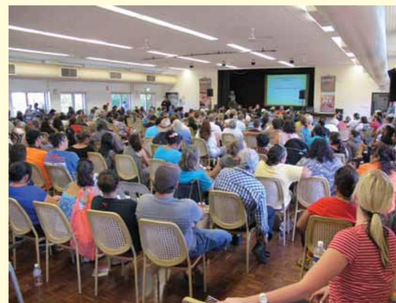
Gumala Members were widely praised for their questions, feedback and robust participation during the AGM & EGM meetings