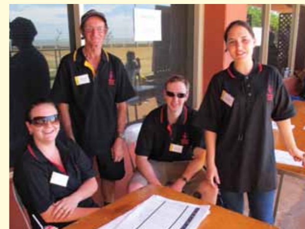
GAC staff enjoying a breather at the registration tables