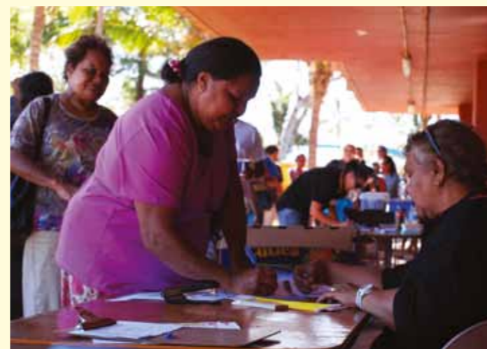
Busy registration tables for Members attending the meetings