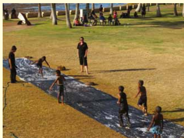
Kids at play