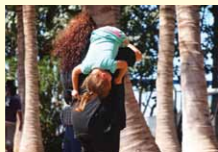
Looking at the world upside down!