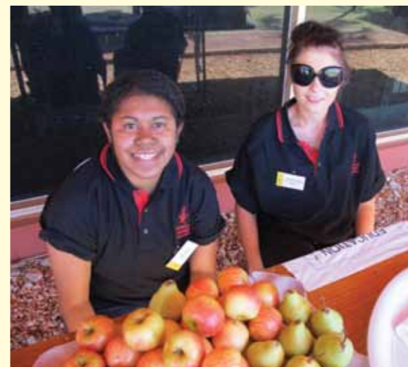
Plenty of food & drinks were provided to Members and their families during the two-day event