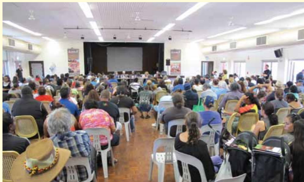
Over 500 Members attended the AGM / EGM weekend at Gratwick Hall, Port Hedland