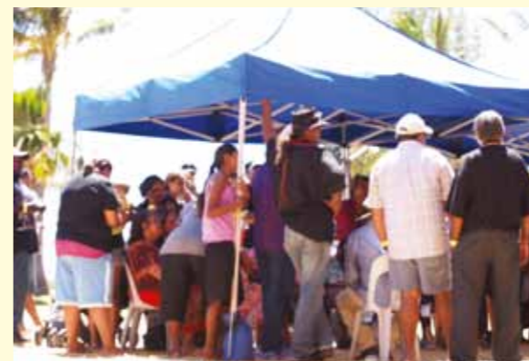
Members engaged in discussions under the marquees