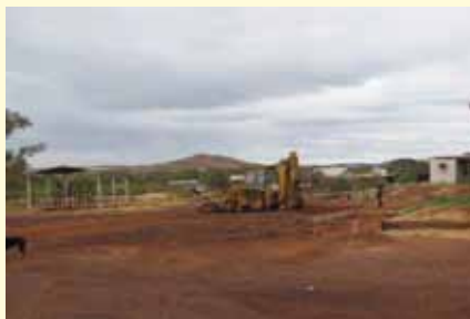
Initial earthworks at the Gumala 0-5 Studio project at Wakuthuni, which is being designed and built in partnership with University of Melbourne