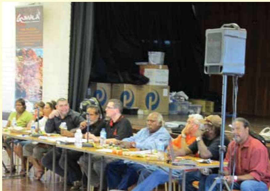
The GAC Board & Chief Executive