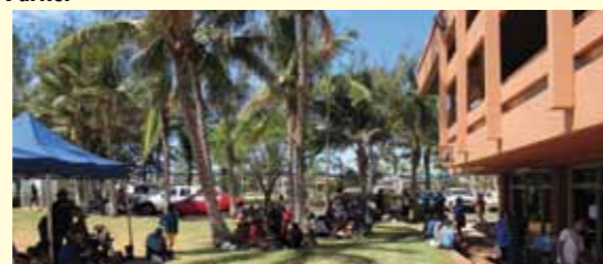
The grounds of Gratwick Hall