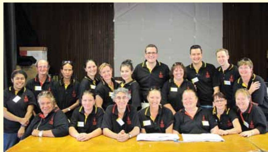
GAC Staff & Management that worked tirelessly during the AGM / EGM weekend