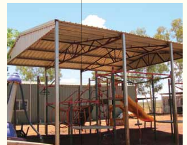
The basketball courts at Youngaleena will be upgraded by Gumala. We also plan to carry out upgrades at all our communities' playgrounds