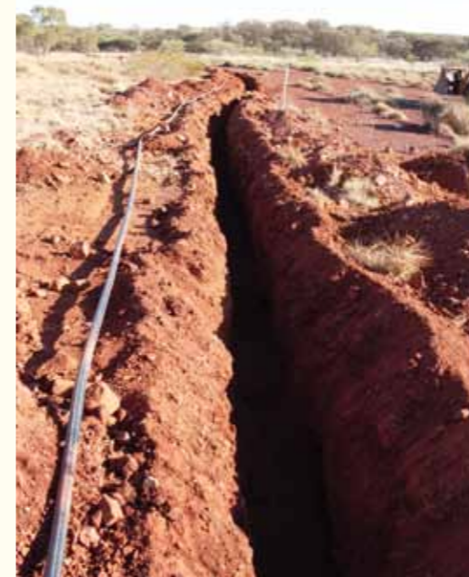
The laying of water pipes at the Wirrilimarra lore camp involved two km of trenching