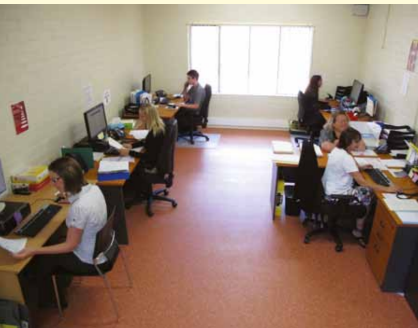
Gumala's new MSU office (MSU 2), which deals with applications and enquiries from Banyjima Members