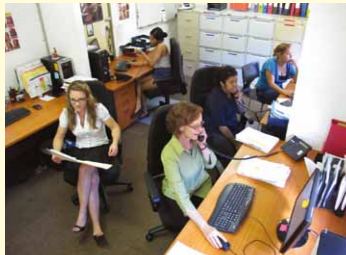
Gumala's original MSU office (MSU 1), which now deals with applications and enquiries from our Innawonga and Nyiyaparli Members