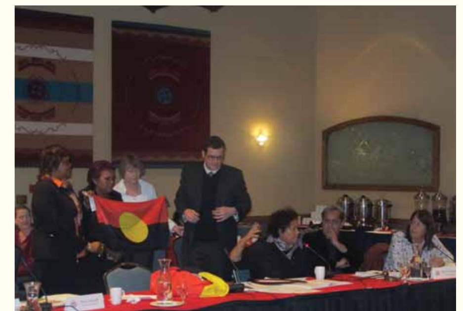
The Gumala delegation presenting the Aboriginal flag to the AFN Board

While clearly different to our land use agreement, the Alaskan model has a number of attractive features that Gumala will seek to adopt as it relies on international best practice to grow and become Australia's leading indigenous corporation.