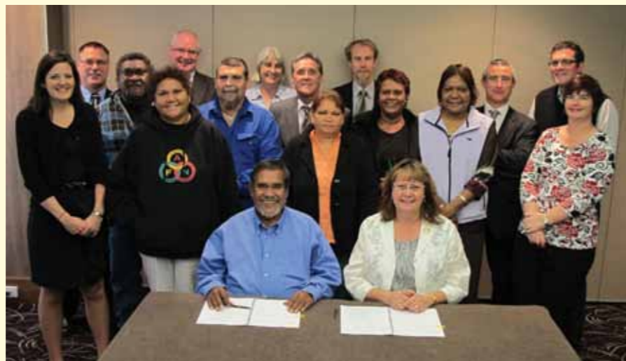
Board and Management representatives of Gumala Aboriginal Corporation pictured together with Murdoch University representatives at the official signing ceremony in Perth.

On completion of the report, a detailed proposal for the