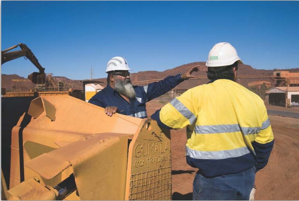
Gumala Contracting employees at a Pilbara iron ore mine site