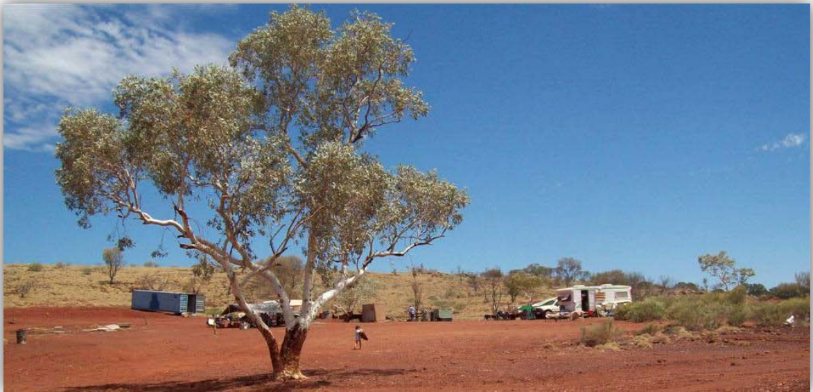
Wirrillimarra Community – 150Kms east of Tom Price

Accordingly, this may have the consequence of encouraging native title agreements with lump sum payments as the principle compensation for the proposed land use due to its income tax treatment.