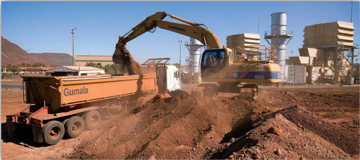
Gumala Contracting machinery in operation in Tom Price.