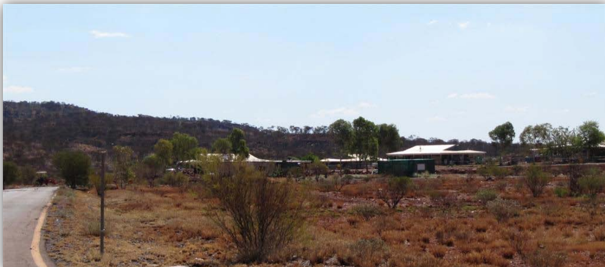
Wakathuni Community – 25Kms south west of Tom Price