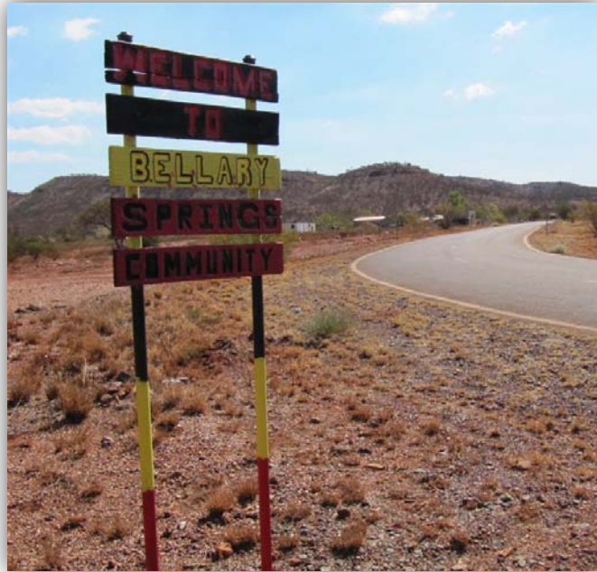
Entrance to the Bellary Springs (Innawonga) Community, 50Kms south west of Tom Price.