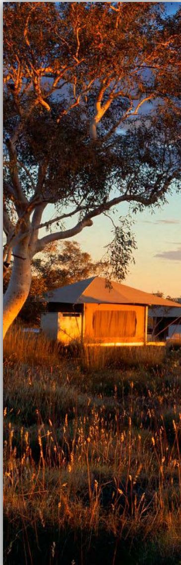
Karjini Eco Retreat, located in the Karjini National Park and 100% owned by Gumala Aboriginal Corporation