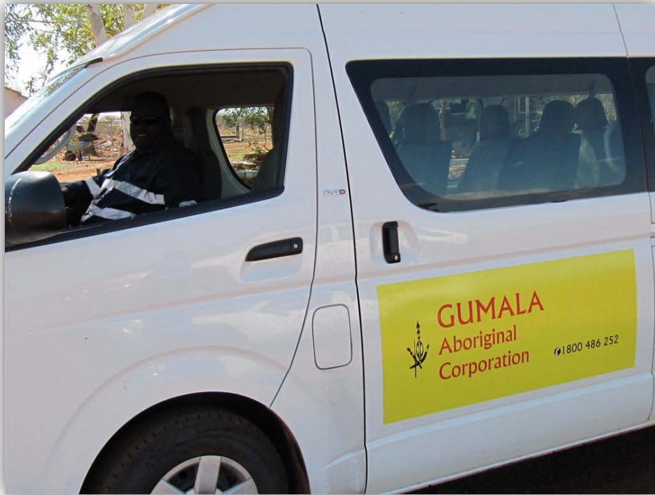
The Gumala's bus service regularly services our communities in the Pilbara, including Tom Price, Wakathuni, Bellary, Paraburdoo, Youngaleena and Port Hedland.