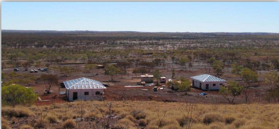
Houses currently being built at the Wirrillimarra Community, 150Kms east of Tom Price