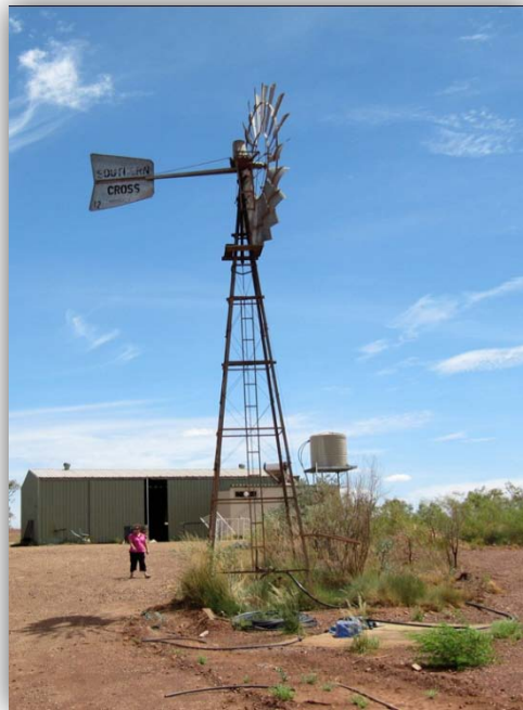
Youngaleena Community – 130Kms east of Tom Price