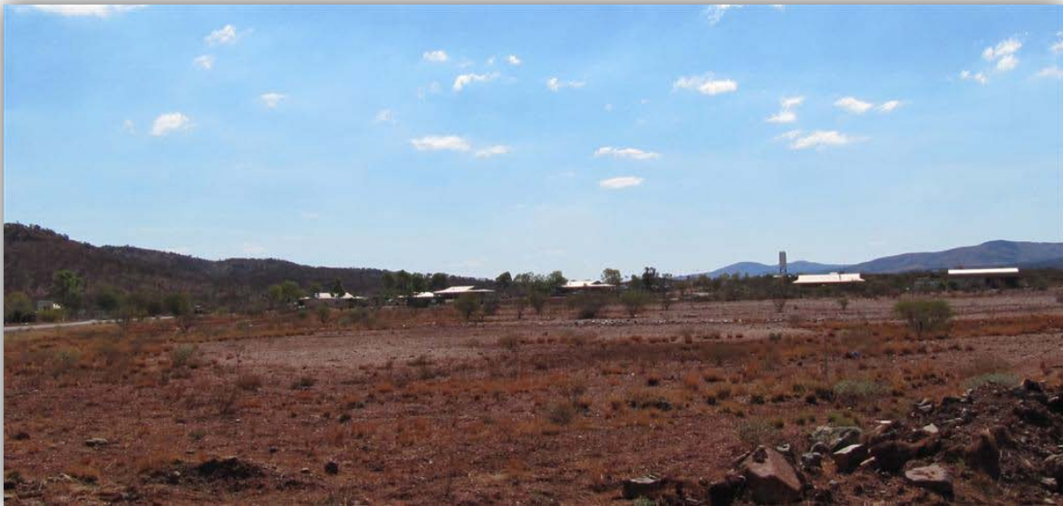
Wakathuni Community, 25Kms west of Tom Price.