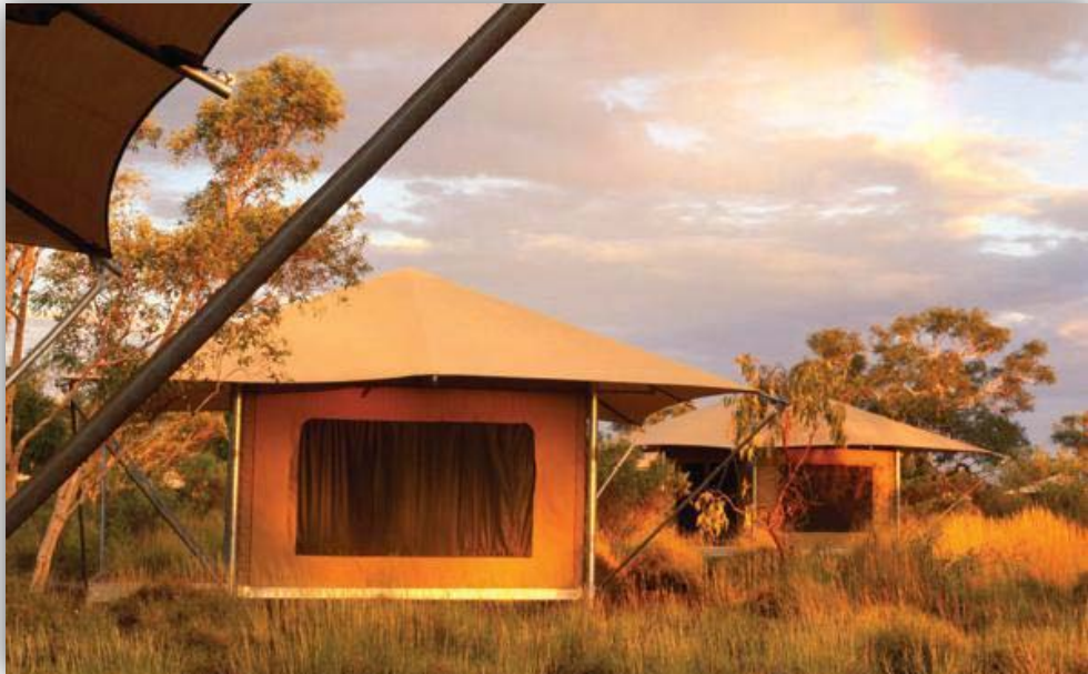
Karijini Eco Retreat, located in the Karijini National Park and 100% owned by Gumala Aboriginal Corporation