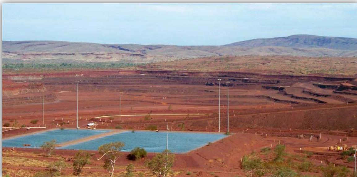
Rio Tinto Yandicoogina iron ore mine.